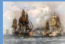
The Battle of Flamborough Head

Such as the Great Gale, the Peace Pageant, Yorkshire Day and the Battle of Flamborough Head.